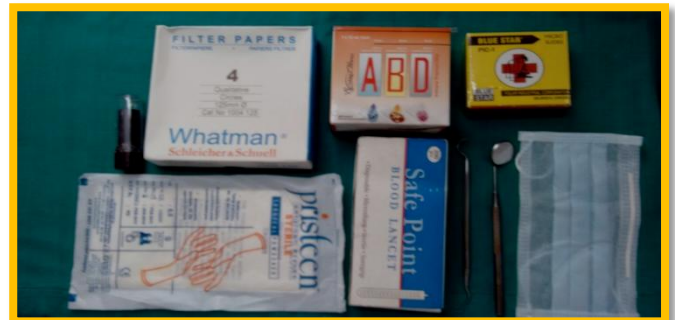
Fig. 1- Armamentarium