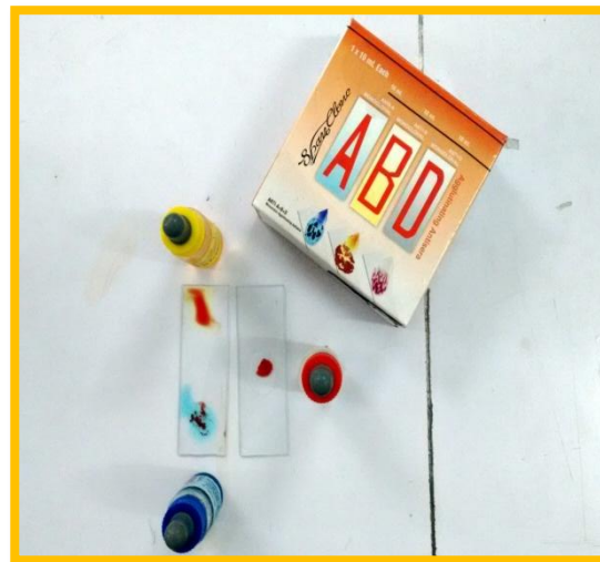
Fig. 2-One drop of blood was placed on slide and was treated by Anti O, Anti A, Anti B respectively